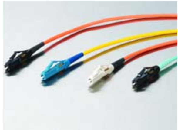
UniCam LC Connectors Family | LAN626