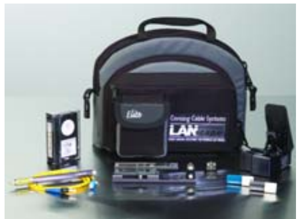
TKT-UNICAM Elite Tool Kit | LAN595